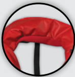
Soft Neoprene Material