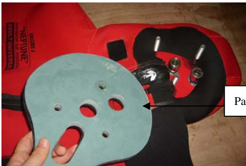
Part 2 Face fixture

2. Place part 1 face fixture inside the immersion suit hood area and zip up. Attention: Stretch the hood fabric by pulling it to the direction of arrows. The hood should not have any folds.