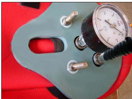
1. Provide air into the suit, through the foot pump, to a pressure of 0,7 to 1,4Kpa (0.1 to 0,2psi) [acc. MSC/Circ.1114.] Maintain the pressure to those limits for the air-test. (It is normal that some bubbles appear at the zipper slides and at the zipper toothed part in the face fixture).