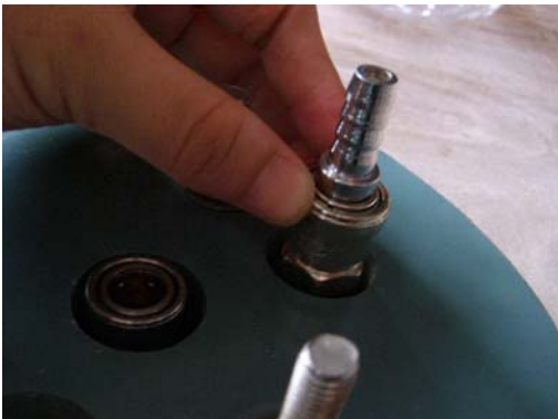
9. Install the Connector for the foot pump, by pressing down the proper joint, so as to insert it properly.