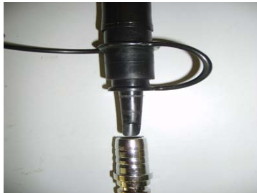
10. Adjust the multi-valve adaptor on the connector of face fixture.