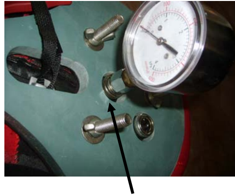
7. Insert the Pressure Gauge at the face fixture, by pressing down -at the same time- the joint at face fixture.