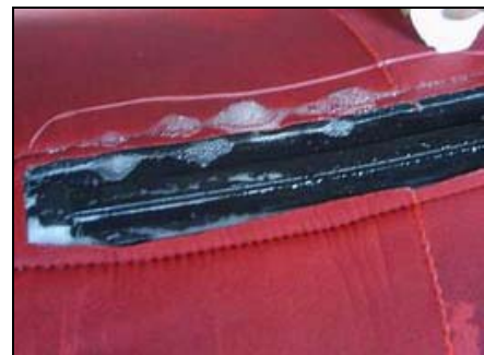
3. Check carefully if any bubbles appear from the Immersion Suit and mark properly the leaking areas of the suit.