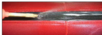
2. Sprinkle along seams and closures of the immersion suit with a soapy water solution.