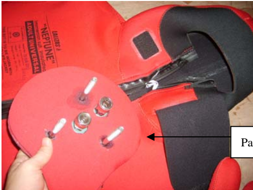
Part 1 Face fixture

1. Lay the immersion suit on a work table and check for damages.