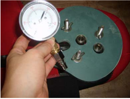
6. Check the pressure gauge for any breaks on the dial surface or to the pointer.